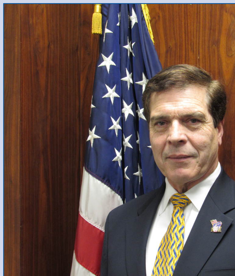
MAYOR ALAN BEACH