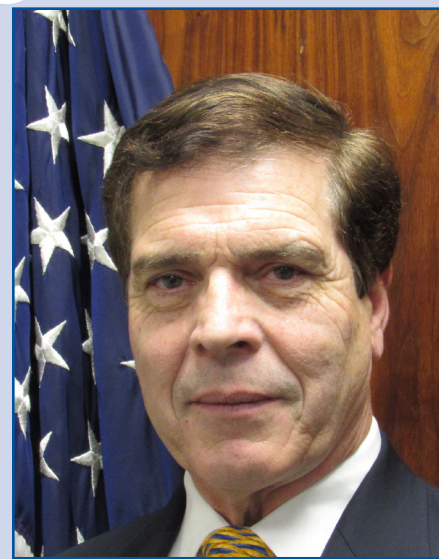
MAYOR ALAN BEACH