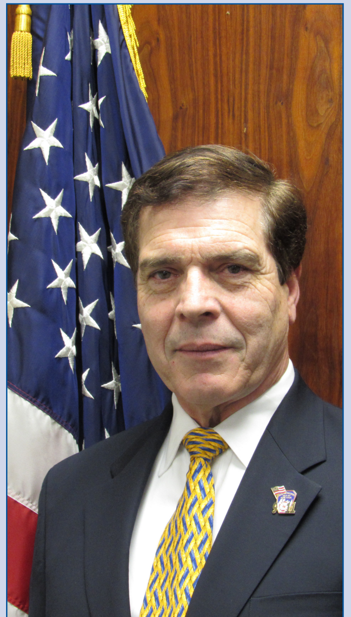
MAYOR ALAN BEACH