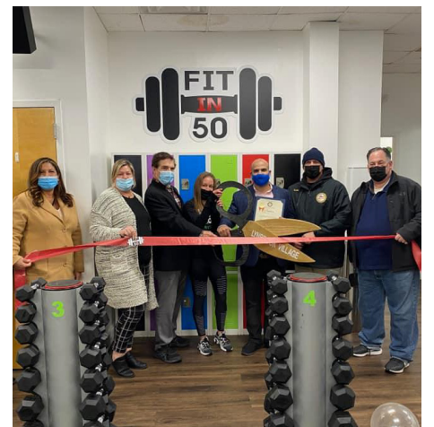
Red Apple Diner & Fit in 50 celebrate grand openings.