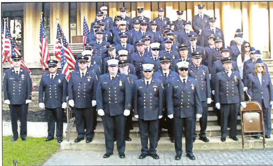
LYNBROOK FIRE DEPARTMENT

spite the evil that descended on us that day, we are forever moved by those that gave the ultimate sacrifice. And in the depths of despair, we find hope and purpose."