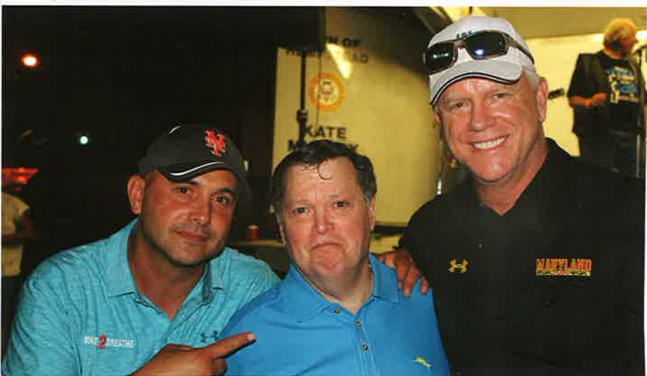
Boomer Esiason and Craig Carton, (Co-Hosts of WFAN's morning radio show Boomer and Carton), arrived in Lynbrook to promote Cappy's Wine and Liquor's one year anniversary at their new location, after which, the Mayor welcomed them at the 5th Annual Wounded Warrior Concert at Truck Company's firehouse hosted by the Lynbrook Fired Department.