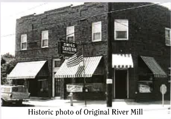
Historic photo of Original River Mill