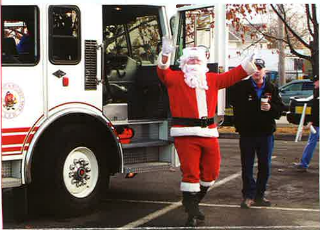
Santa greets the crowd of children