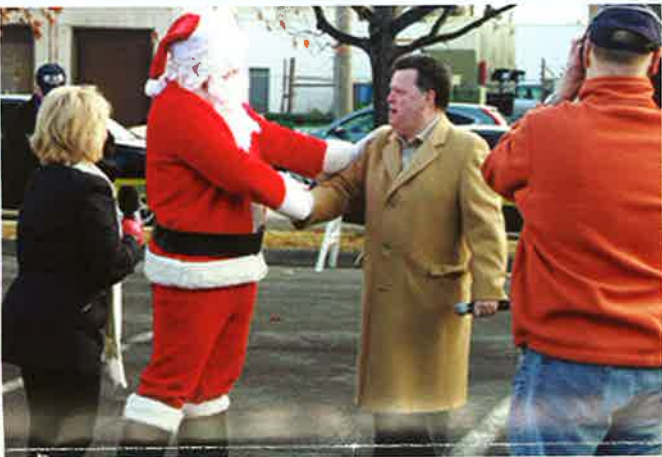
The Mayor greets Santa