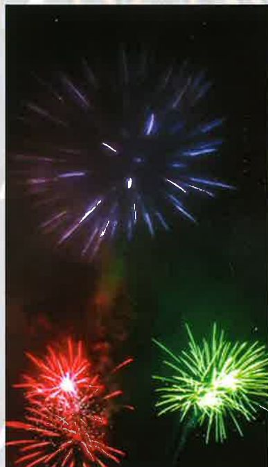
Patriots' Weekends with Fireworks