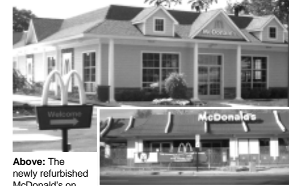
Above: The newly refurbished McDonald's on Merrick Road. Inset: McDonald's before renovation.

The RPA will be working with a team of Village and Chamber of Commerce members to plan for future "Smart Growth" in the business area. The plan is expected to be completed by the end of the year.