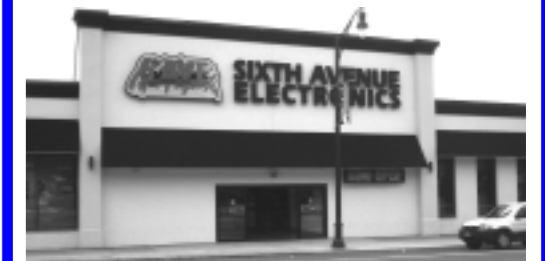
Above: The new 6th Ave. Electronics, located on the former site of Harrow's pool supplies (shown below).

Broadway and Saperstein Plaza, have been eyed by the Village for improvements, and discussions are underway with the respective land owners.