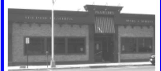
Above: McQuades Restaurant. Below: The property before beautification.

In the meantime, two major buildings that anchor the shopping district, the movie theatre at Five Corners and the abandoned three-story building at the corner of