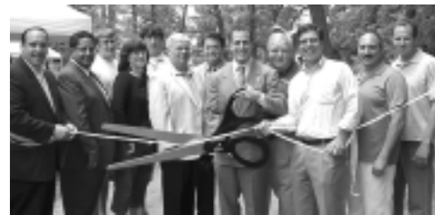
Larson Park Playground complements Greis Park Playground, affording families on the East and West of Lynbrook

"We are proud of re-opening the park and look forward to other Village improvements," added Mayor Curran.